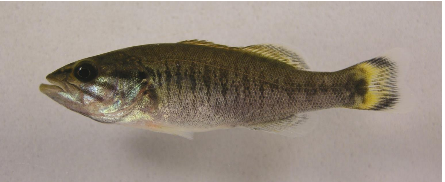
Juvenile Smallmouth bass ( Micropterus dolomieu ), approximately 55 mm fork length, sampled at the John Day Dam Smolt Facility on August 3, 2023.