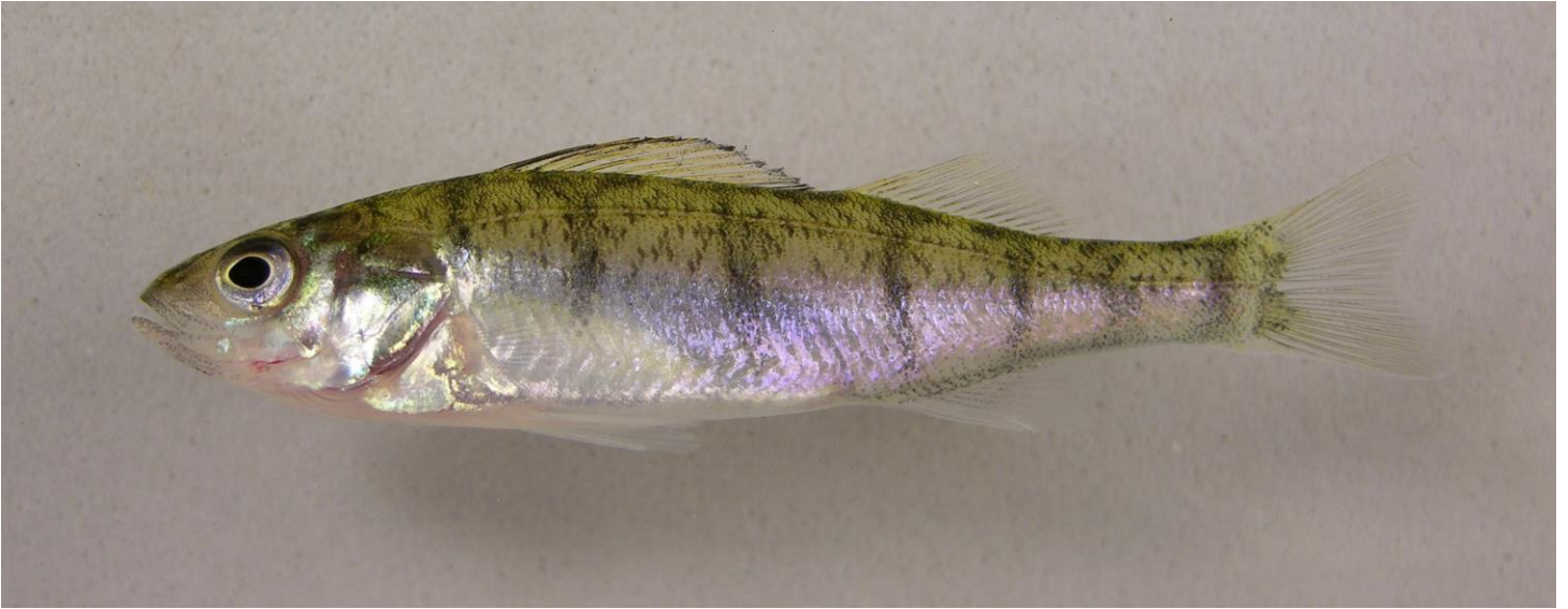
Juvenile Yellow perch ( Perca flavescens ), approximately 60 mm fork length, sampled at the John Day Dam Smolt Facility, sampled on August 3, 2023.